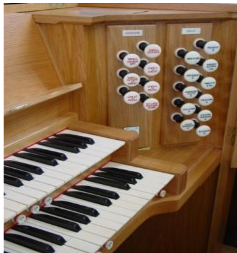
The oak console