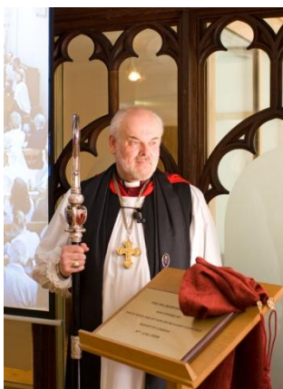
The Bishop of London

For St Paul's Church, the celebration was the realisation of a vision that was born some 8 years ago to restore the past, build for the future and serve the community. The vision has involved securing the long term future of the Grade II listed building, increasing capacity for the growing congregation, creating a more flexible church interior to meet the needs of today's worship, creating additional Church and community facilities in the crypt, building a new entrance area on the north side of the Church and very importantly ensuring the building was fully accessible for disabled visitors. Collectively, these physical developments will enable St Paul's to enhance its spiritual mission and community outreach and to develop its heritage and educational programmes.